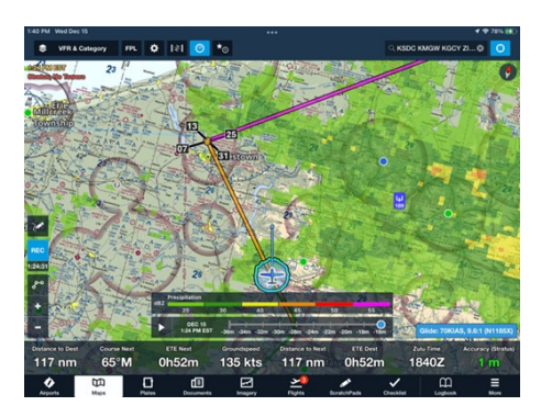
(Continued from page 5)

der a high overcast and occasional light precipitation. As I approached Bradford, PA, I was starting to see the weather associated with a cold front moving to the east. I would not be able to continue straight home. Using ForeFlight, ADSB, ATC