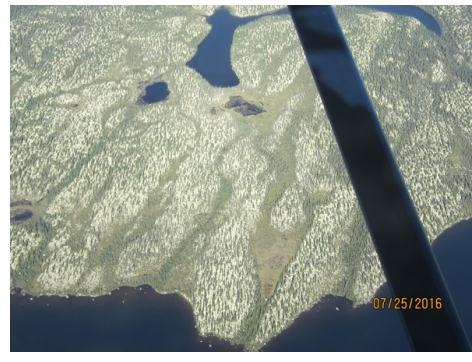
The next day we all flew back to Rapid Lake, did some fishing and then packed up for the trip home. Low ceilings and IFR to Schefferville plus the approach. MVFR to

Arctic Char like the brown bears in Alaska do. Due to the lack of sea ice and therefore the lack of seals, they have now learned the new skill. The camp is surrounded by an electric fence to keep the bears away. One of the guys had a .44 Magnum pistol just in case. We flew around land's end and then back to Barnoin.