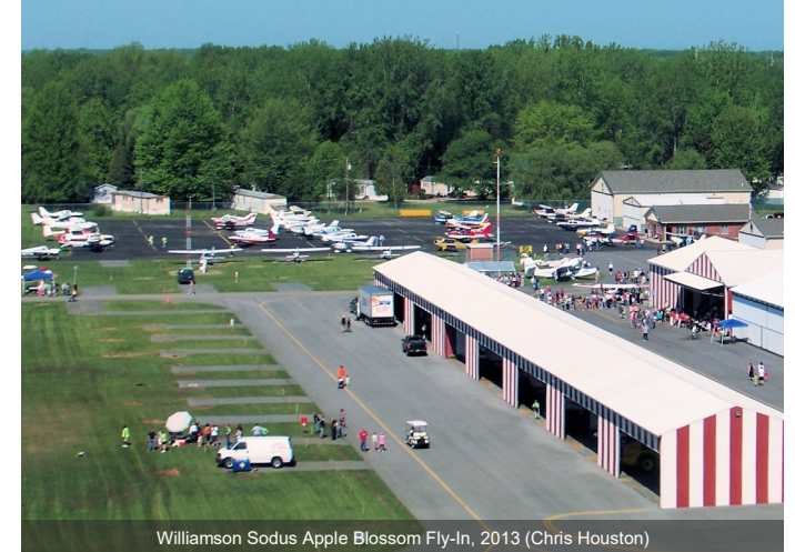
(Continued on page 3)

garding your assignment please contact your committee chairperson. If you do not see your name on the roster please contact