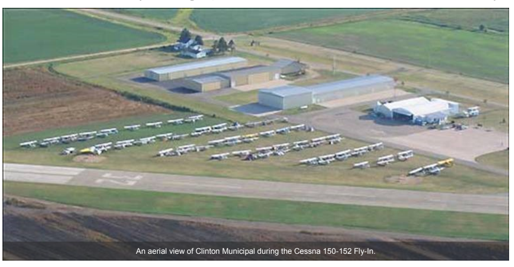
(Continued on page 3)