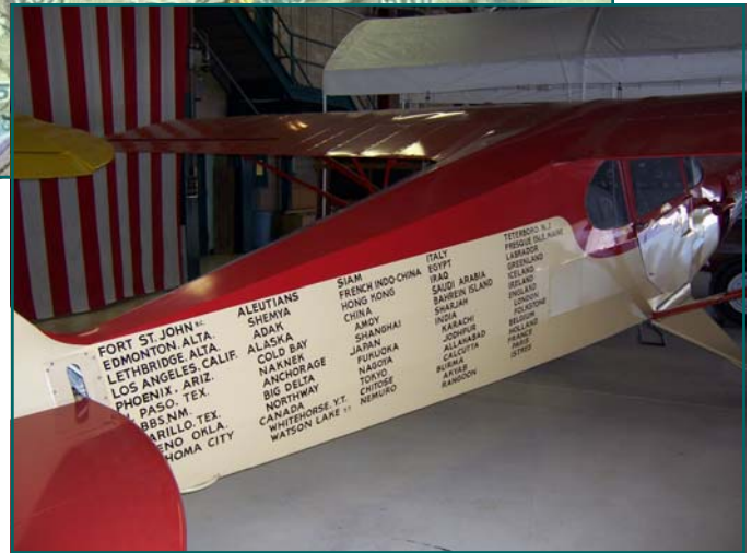
The City of Angels— One of two Super Cruisers that made an around-the-world flight in 1947

museum's history centers on the line of Cubs built in Lock Haven, along with Comanches, Twin Comanches, Apaches, Senecas, Navajos, and Cheyennes. Cherokees were built in Vero Beach, FL. Several aircraft are located downstairs in a hangar, one of which is a Cub flown around the world (see photo). We found the museum and its history well worth the trip, and we encourage all fellow pilots to make the pilgrimage to LHV.